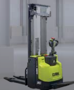
Pallet Stacker Platform version 1.200 / 1.600 kg