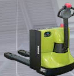
Low-lift Pallet Truck 2.000 kg