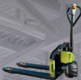
Lithium-Ion Hand Pallet Truck 1.200 kg