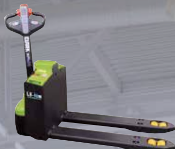
Lithium-Ion Low-lift Pallet Truck 2.000 kg