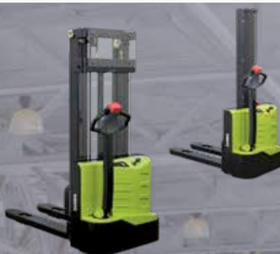
Low-lift Pallet Truck 1.000 kg