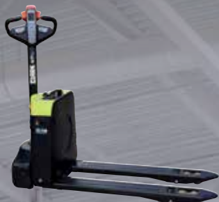
Lithium-Ion Low-lift Pallet Truck 1.800 kg