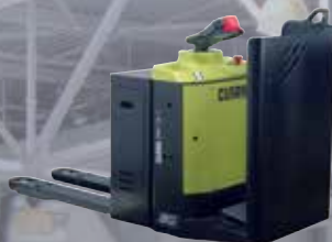
Low-lift Pallet Truck Platform version 2.000 kg