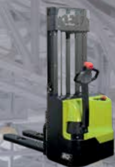
Pallet Stacker Multi-purpose Vehicle 2.000 kg