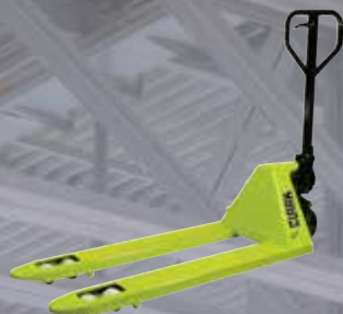
Hand Pallet Truck 2.500 kg