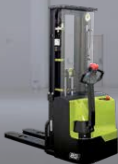
Pallet Stacker 1.200 / 1.400 kg