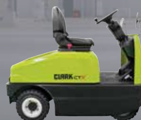
Electric Tow Tractor 4.000 / 7.000 kg