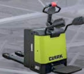
Low-lift Pallet Truck / Lithium-Ion version 2.000 kg