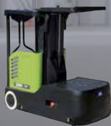
Multifunctional Order Picker 226 kg