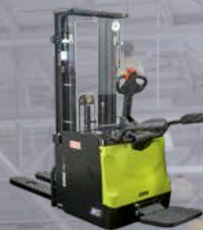
Pallet Stacker Platform version 1.600 kg