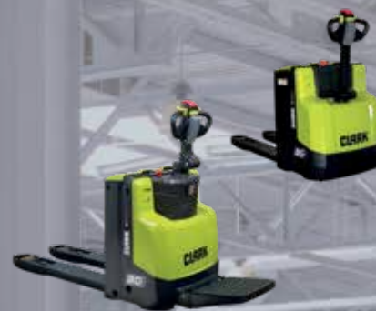
Low-lift Pallet Truck Platform version 2.000 kg