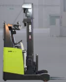
Reach truck 1.400 / 1.600 kg