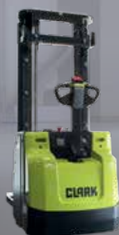
Pallet Stacker 1.200 / 1.600 kg