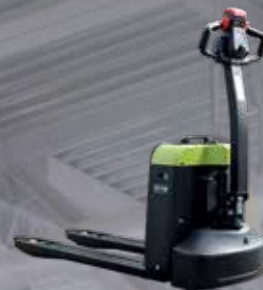
Lithium-Ion Low-lift Pallet Truck 1.500 kg